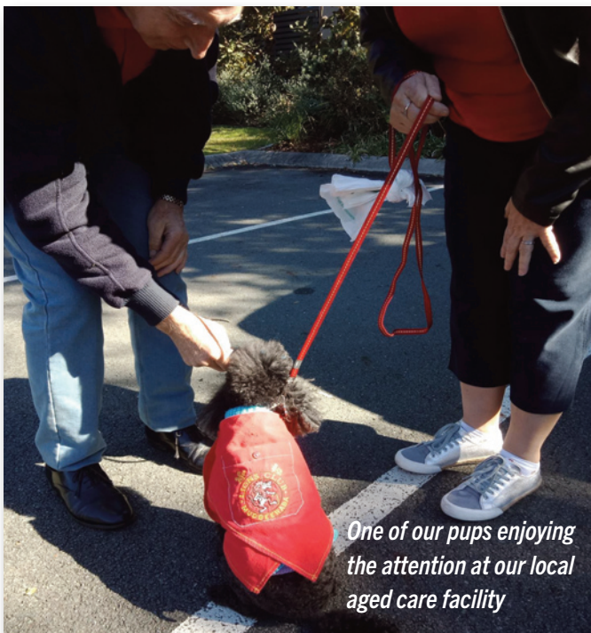
One of our pups enjoying the attention at our local aged care facility

Our Club was very excited to do even better this year. We are still under some restrictions to visit homes, but we wanted to make our gift bags better. We wanted to put more thought into what was in the bags. One idea was making Lavendar Pillows. The