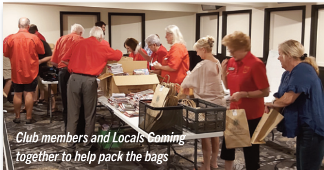
Club members and Locals Coming together to help pack the bags

In the end we had 300 bags packed with socks, scarves, sanitizer, Lavendar pillows, Crossword/Sudoku, word books, writing pads, pens, Christmas Card from our Club and a pack of 5 blank Christmas cards for them to fill out for their friends.